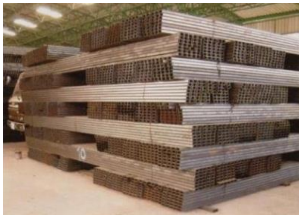
The company successfully expanded its IP portfolio to include different types of steel products

VSI's earliest goal – in addition to developing its intellectual property (IP) portfolio – was to enhance its capacity by collaborating with national and international partners. Indeed, the company was founded as a joint-venture between investors from Laos, Thailand and the Hong Kong Special Administrative Region of the People's Republic of China (PRC).