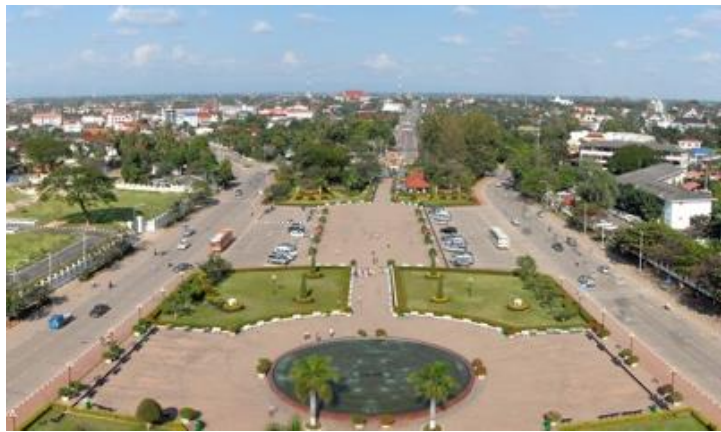
VSI is based in the capital city of Vientiane

Established in 1994, the Vientiane Steel Industry Co., Ltd. (VSI) is the oldest steel mill in the Lao People's Democratic Republic (Laos). VSI's origin lies with the Laotian government's decision to promote industrialization under the New Economic Mechanism (NEM) – an initiative started in 1986 to liberalize the country's economy. Construction of VSI's first factory began in 1996 and