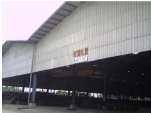
Well-known trademarks have helped VSI to become one of the leading steel mills in Laos

With the success of the NEM initiative and increased industrialization, domestic demand for good quality construction materials and equipment in Laos is significant. Previously, local demand was met through imports as there were no steel mills in the country. When VSI was established, it set a goal to satisfy local consumption needs first. Indeed, the company's sales meet as much as 60 percent of the domestic demand for steel – this success is in part due to the company's good name and easily recognizable brands.